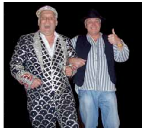
The Barrow Boys, including the real Pearly King of Camberwell,.

Details of all new and events can also be found at www.stoneparishcouncil.com